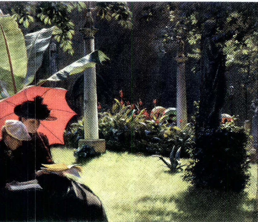
CHARLES-LOUIS NICOLAS (1824-1890), AFTERNOON IN THE CLUNY GARDEN, PARIS, 1889. OIL ON CANVAS, 21 X 31 CM. THE METROPOLITAN MUSEUM OF ART, NEW YORK.